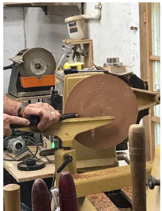
Beginnings shape cuss and sanding