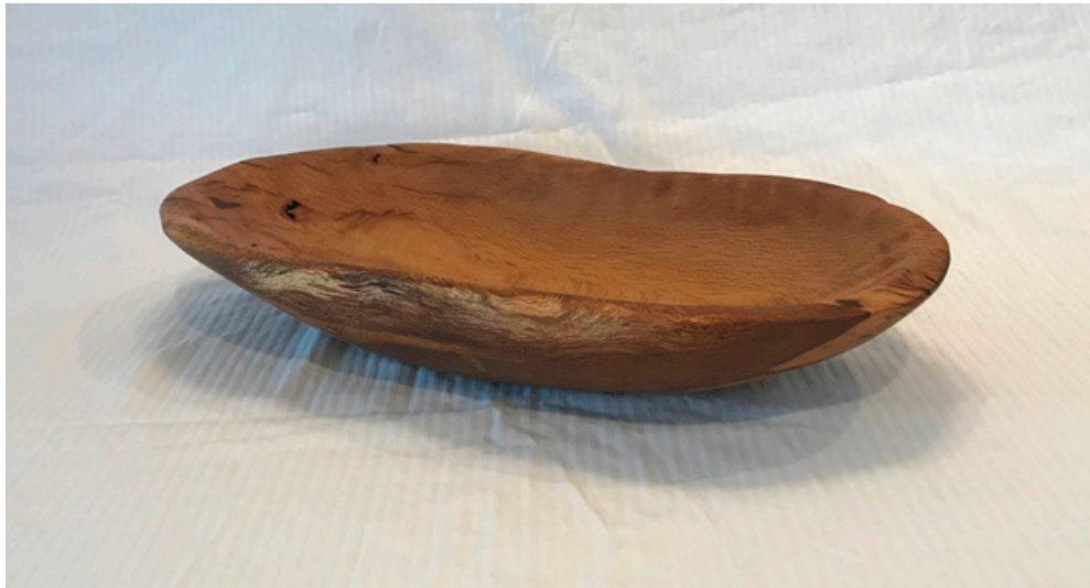
Dough bowl carved from st simons live oak Walnut oil finish