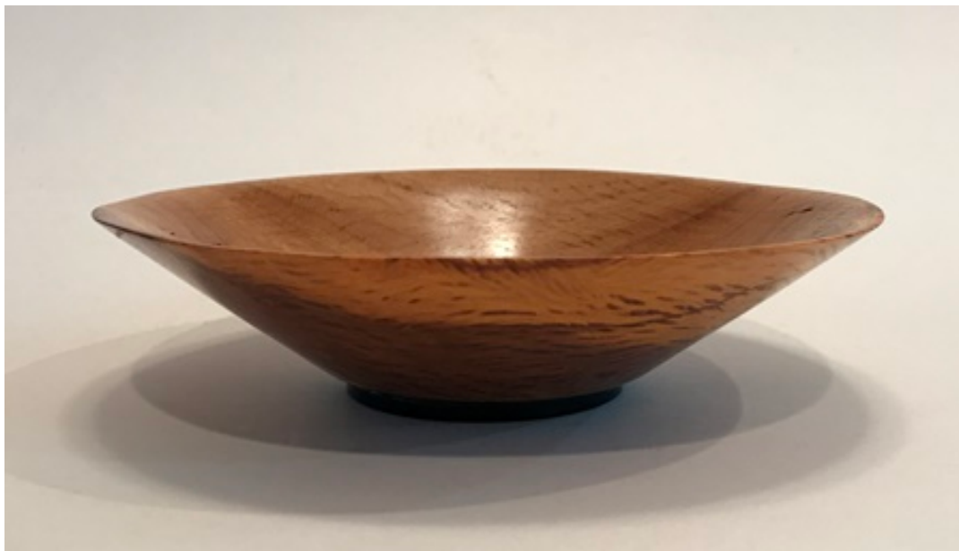
Live oak / Ebony bowl Tung oil fish