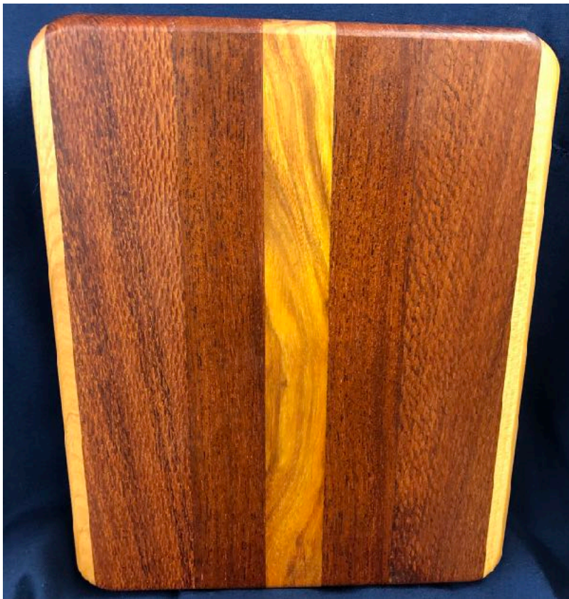
Maple / Leopard / Mystery / Canary then Leopard and Maple