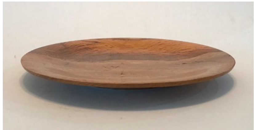
Small oak dish