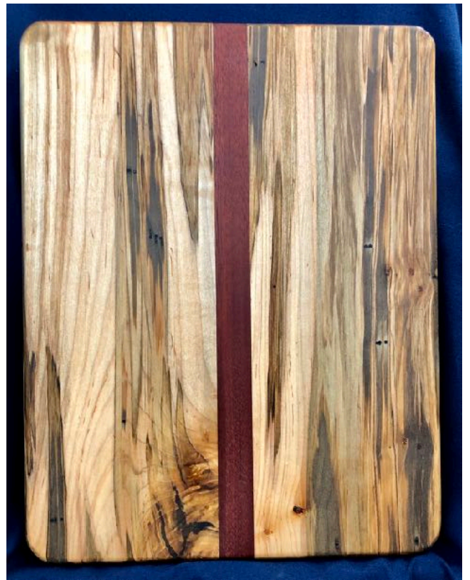
Ambrosia Maple and Bloodwood