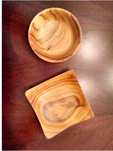
Karen's Canarywood Mini Bowls