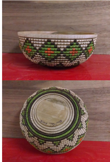
Barb's Basketweave Bowls