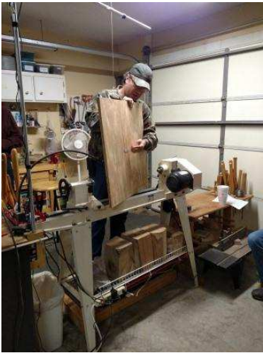
Chuck's Bandsaw Jig for Cutting Bowl Blanks