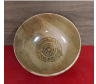
Barb's Textured Bowl