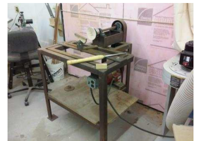
Jim's "New" Lathe