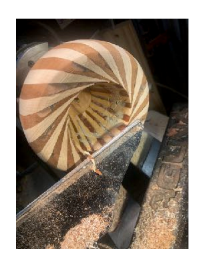
Maple and Sapela 3" high a 6" dia