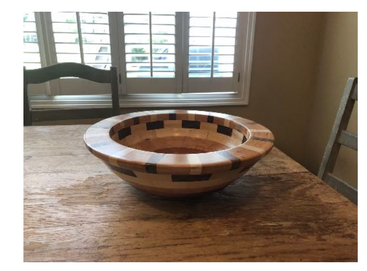
Rick first pc to completion. We spent a couple hours together till the smoke spewed out his ears. Good job done