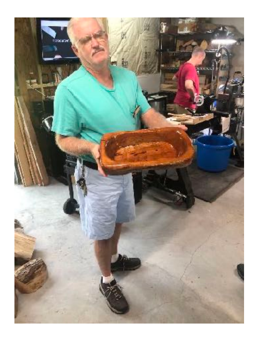
Proud as punch. a poxy covered bread bowl. Bet you can not guess time spent on this