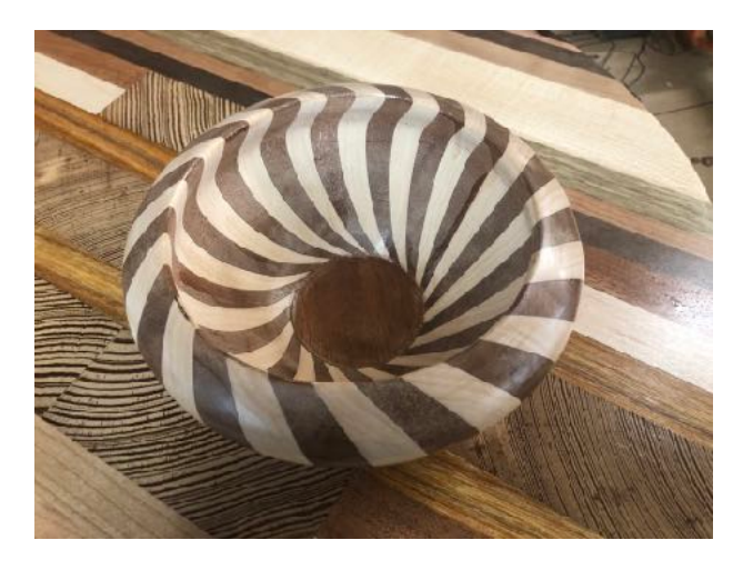
Glue up on lathe turned center finish to complete