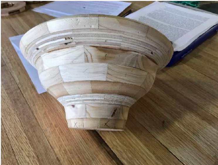
First bowl built of junk Segmented collars in oak