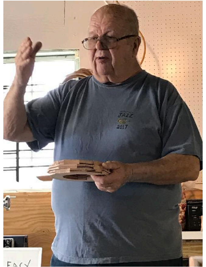
Showing the idea of graph paper with design entered.